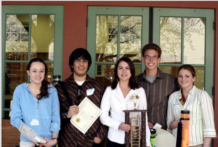
SB County Architectural Competition 2007